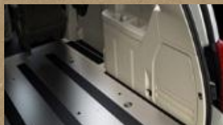
Standard flat load floor